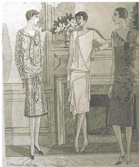
L to R: Pattern Nos. 1884, 1862, and 1844

I remember frequent Saturday shopping trips to Woodies, Hechts, Kann's and Lansburgh's where I would wait impatiently while my mother and sister sorted through huge pattern books by McCall, Vogue, Butterick, and others. I even remember when G Street Fabrics was actually located on G Street.