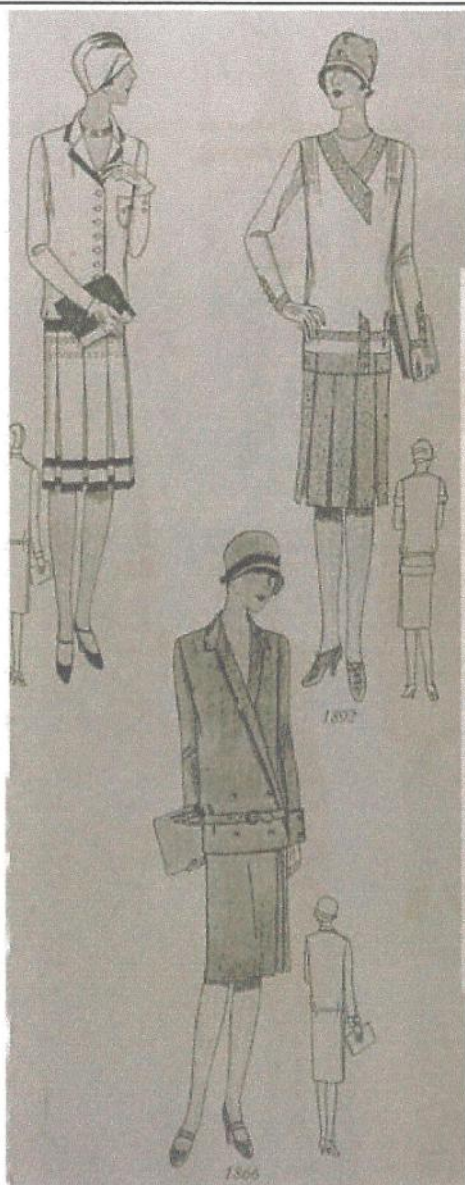
Upper left: 1854 Upper right: 1892 Bottom: 1866