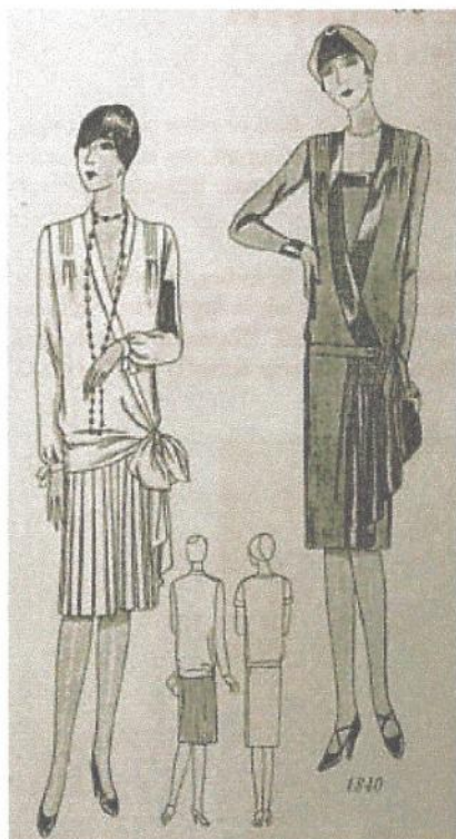
L to R: Pattern Nos. 1865 (blouse), 1859 (skirt), and 1840 (dress).

My mother was still shopping at G Street Fabrics, although now at the Chantilly location, and making her own dresses when she was 85. But she was no longer buying patterns. Instead she would use patterns purchased in the 1940s and 1950s and "update" them. In a sense, she had become a pattern collector. When my mother died, her pattern "collection" was tossed. I now realize that patterns, like virtually everything else from the past, are indeed collectible, albeit to a fairly limited group of collectors.